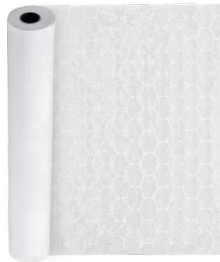
Power Prep™ Rolls