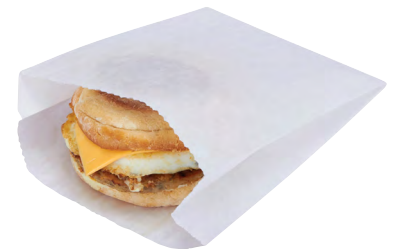
Power Prep™ Bags