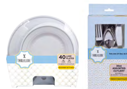
Tablelux Retail Solutions Retail ready dinnerware, drinkware and cutlery