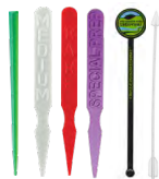
Spirit® Variety of shapes, sizes, and materials for food service accessories