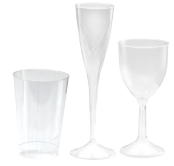
Drinkware Traditional tumblers to trendy stemware