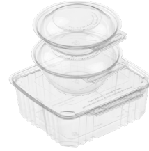
BreakAway™ Patented tamper-evident feature