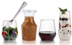
Reserv™ Stemless and sophisticated disposable drinkware