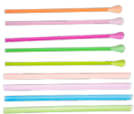
Straws For fancy cocktails, special catering needs, or everyday use