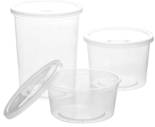
Deli Containers Ideal for deli, grocery, restaurants, and more