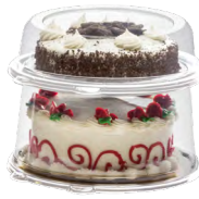
Cake Pak™ Patented EZ Release system designed for multiple dome applications