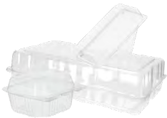
Polar Pak® Innovated grab N go foodservice packaging