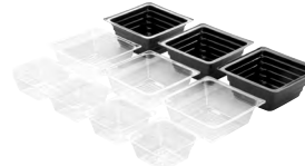
Atrium™ A wide variety, specifically designed with educational foodservice in mind