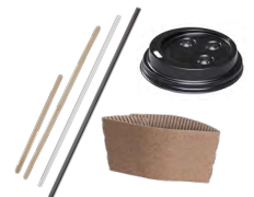
Paper Hot Cups Accessories Sleeves, lids, and stirrers