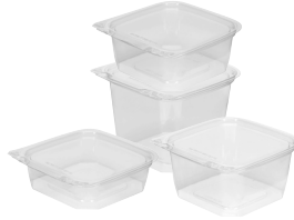
TamperFlag™ With an easy-to-see "flag" after opening that alerts consumers of tampering