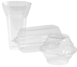
Dessertware A variety of clear dessert containers for any sweet treat