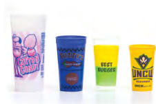
Souvenir Cups Customizable drinkware