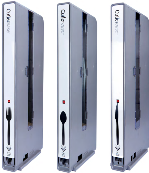
CEASEFKDISPENSER CEASESPDISPENSER CEASEKNDISPENSER