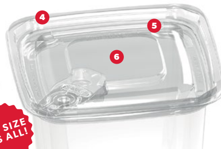
Shown with tab down