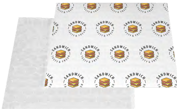
Custom print available