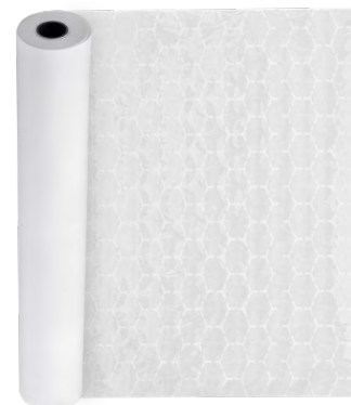
Rolls also available