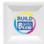
Milan™ Grand™ Square Plate (sizes 6.5", 9.5") MOQ - 300 Pieces