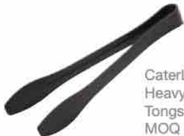
CaterLine™ Heavy-Duty Tongs 9" MOQ - 30 Cases