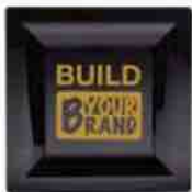
Milan™ Grand™ Square Plate (sizes 6.5", 9.5") MOQ - 300 Pieces