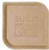
Eco-Products™ Dahlia™ Plates (sizes 6", 9") MOQ - 100,000 Pieces