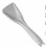
Eco-Products™ Serving Spoon and Spatula 10"