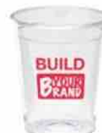
Comet™ Rigid Tumblers (sizes 1oz to 16oz) MOQ - 15,000 Pieces