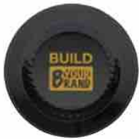
Masterpiece™ Round Plate (sizes 6", 7.5", 9", 10.25") MOQ - 300 Pieces