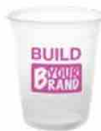
Pro-Flex™ Soft Sided Cups (sizes 12oz to 20oz) (available in white and clear cups) MOQ - 15,000 Pieces