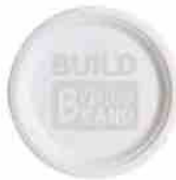
Eco-Products™ Sugarcane Plates (sizes 6", 7", 9", 10") MOQ - 100,000 Pieces