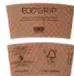
Eco-Products™ BlueStripe™ EcoGrip™ Hot Cup Sleeve (up to 2 colours) MOQ - 40 Cases