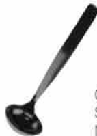
CaterLine™ Small Ladle 9" MOQ - 30 Cases