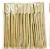
Touch™ Paddle Skewers Heat Stamped 1 side MOQ - 250 Cases