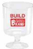
Classicware™ (sizes 2oz to 8oz) MOQ - 25,000 Pieces