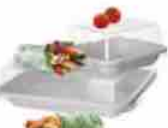
Eco-Products™ WorldView™ Take-out Round, Rectangular and Square Containers (all sizes)