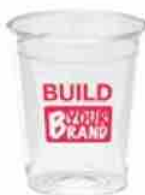
Comet™ (sizes 1oz to 12oz) MOQ - 25,000 Pieces