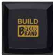
Milan™ Square Plate (sizes 5.375", 6.75", 8.25", 9.25") MOQ - 300 Pieces