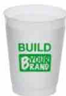
Frost-Flex® (sizes 5oz to 24oz) MOQ - 25,000 Pieces