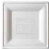
Eco-Products™ Sugarcane Plates (sizes 6", 8", 10", 10"x 5") MOQ - 100,000 Pieces