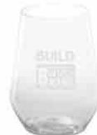
Stemless Glass (size 14oz) MOQ - 20 Cases