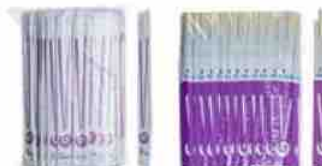
Touch™ Chopsticks envelope (sealed and open) (up to 4 colours or CMYK) MOQ - 250 Cases