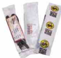
Overwrap Film (up to 4 colours)