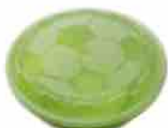
Round Cube Deli Microwavable and Take-Out Containers Lid Only MOQ - 500 Cases