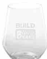
Stemless Glass (size 12oz) MOQ - 20 Cases