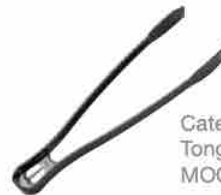
CaterLine™ Tongs 9" MOQ - 30 Cases