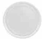
Eco-Products™ Deli and Portion Cup Lids (sizes 2oz to 32oz)