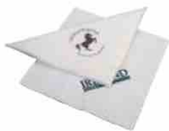
Napkins (1 or 2 Ply) (up to 4 colours)