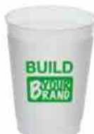
Frost-Flex® Tumblers (sizes 5oz to 24oz) MOQ - 15,000 Pieces