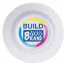
Masterpiece™ Round Plate (sizes 7.5", 10.25") MOQ - 300 Pieces