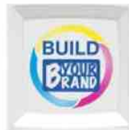
Milan™ Square Plate (sizes 6.75", 9.25") MOQ - 300 Pieces