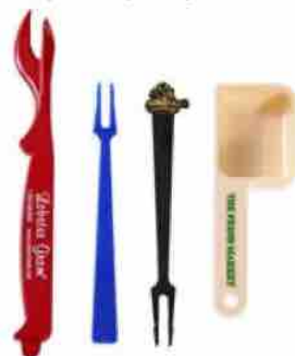
Standard & Custom Shaped Products Print MOQ - 5,000 pieces Molded MOQ - 50,000 pieces (25,000 pieces for repeat orders)