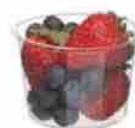
Eco-Products™ Portion Cups (sizes 2oz to 4oz)