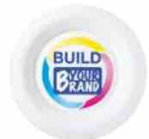
Milan™ Round Plate (sizes 6.75", 9.25") MOQ - 300 Pieces