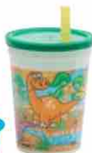
Kids FunCups™ (size 12oz only) MOQ - 5,000 Pieces