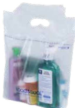
Delivery of personal care items and/or prescriptions.