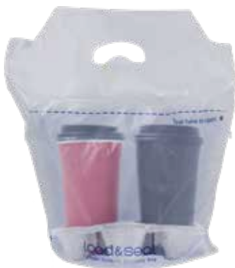
2 drinks in carrier or 2 large without