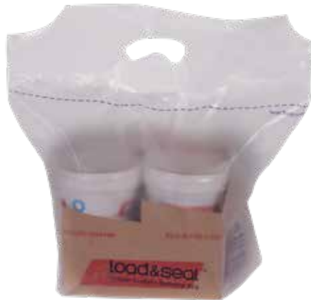
4 drinks in carrier