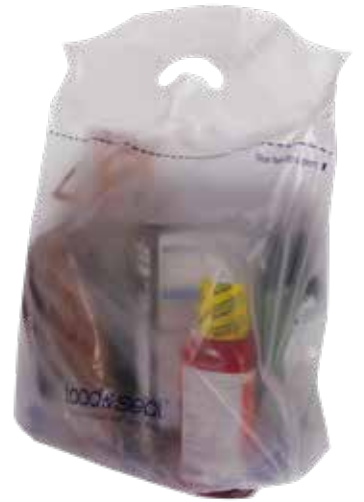
1/7 - 1/6 bbl for grocery items