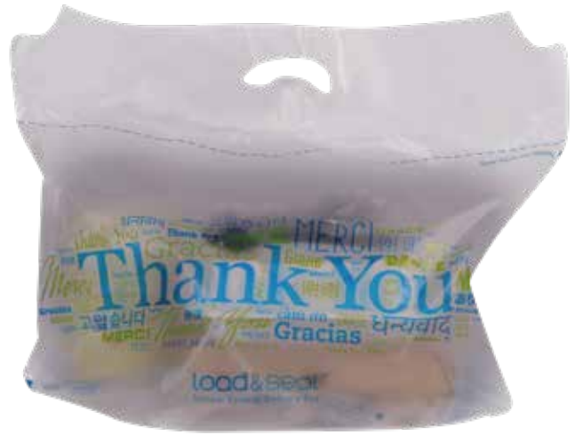
3 Large containers and side dishes