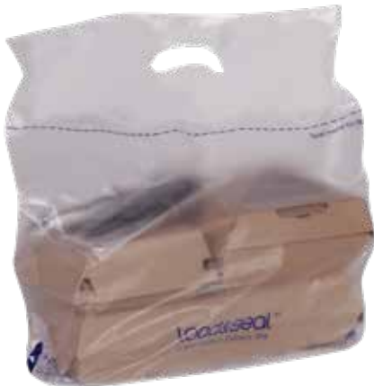
2-3 standard size containers