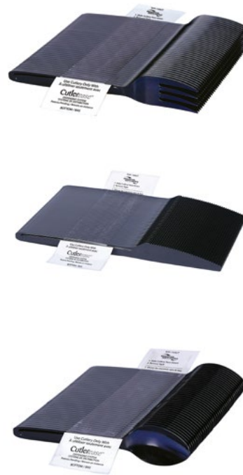
CUTLERY REFILL PACKS